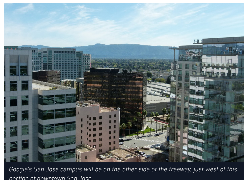
portion of downtown San Jose.

All that construction activity has driven up costs for labor and material. By most estimates, costs have risen 10-15 percent a year for nearly five years now. At this rate, by 2020 when a lot of the